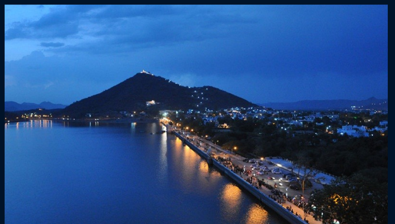
Fateh sagar lake

Note: Conference can be attended in online mode also.