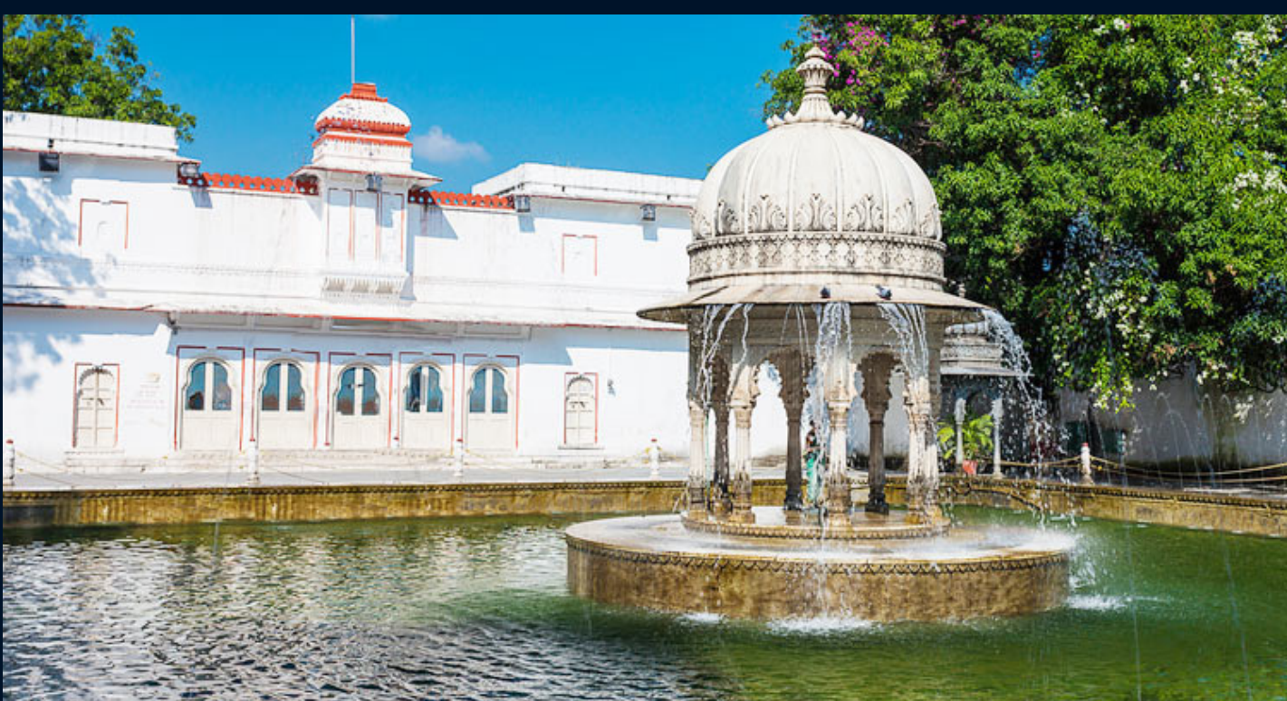
Saheliyon ki bari