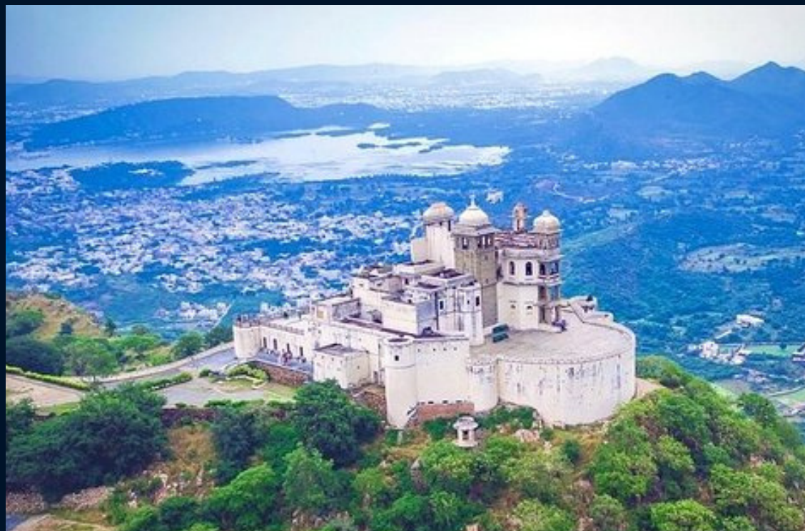
Sajjan garh fort